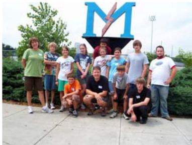
"The whole crew after yard work"