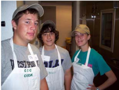
"Serving lunch at a soup kitchen in Houston.."