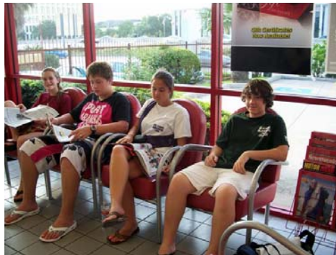
"Chilling at discount tire waiting for a new tire for the van. Good times!"

We are looking forward to another great year of youth ministry at The Well! If you want to see even more pictures from last year make sure you join us on February 16 for our Pancake Supper fundraiser!